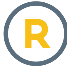
International Trademark Registration