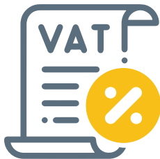
VAT Registration and Compliance