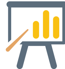
General Data Protection Regulation (GDPR)