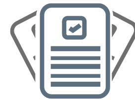
WallPost ERP Software Solution