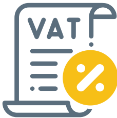
VAT Registration and Compliance